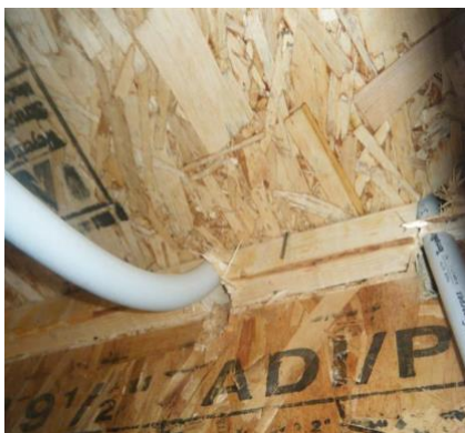
Wood I beam- Top flange cut, must be repaired, Repair design by Engineer.