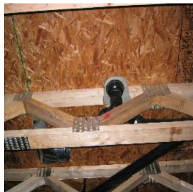
Wood Floor Truss- Top cord cut through, Need Engineer to design repair.